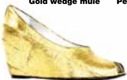
Gold wedge mule Perforated leather twist wedge mule Ruched flat sandal in slate suede

▲ Spirithouse Basic V in waves, Sasha cardigan in black openweave, Stepladder shirt in pencil stripe.